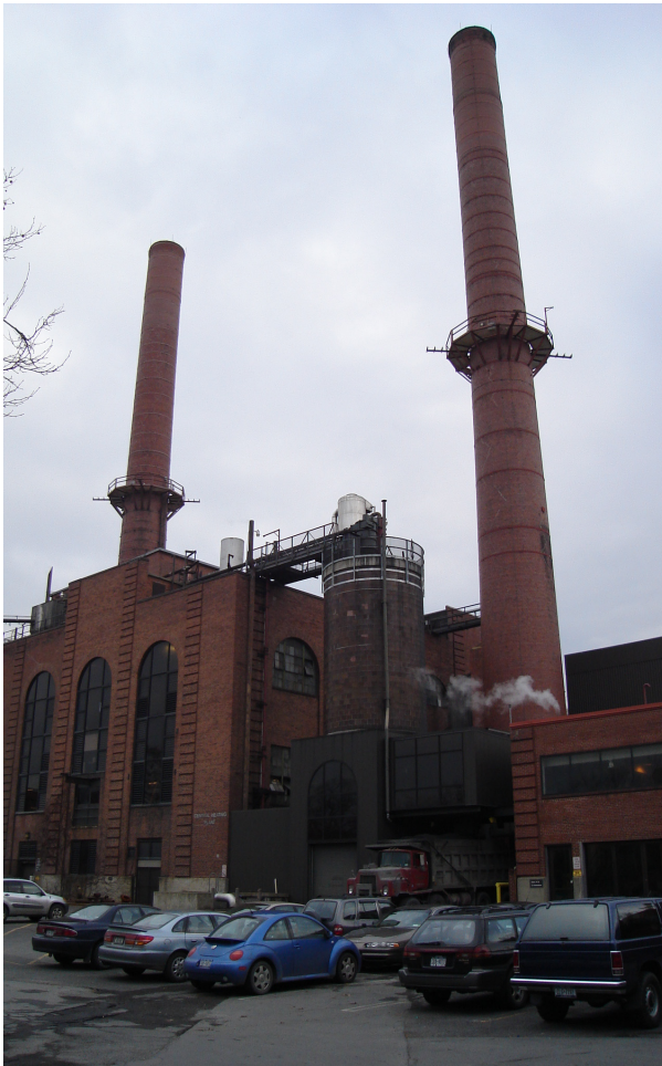
Combined Central Heating and Power Plant