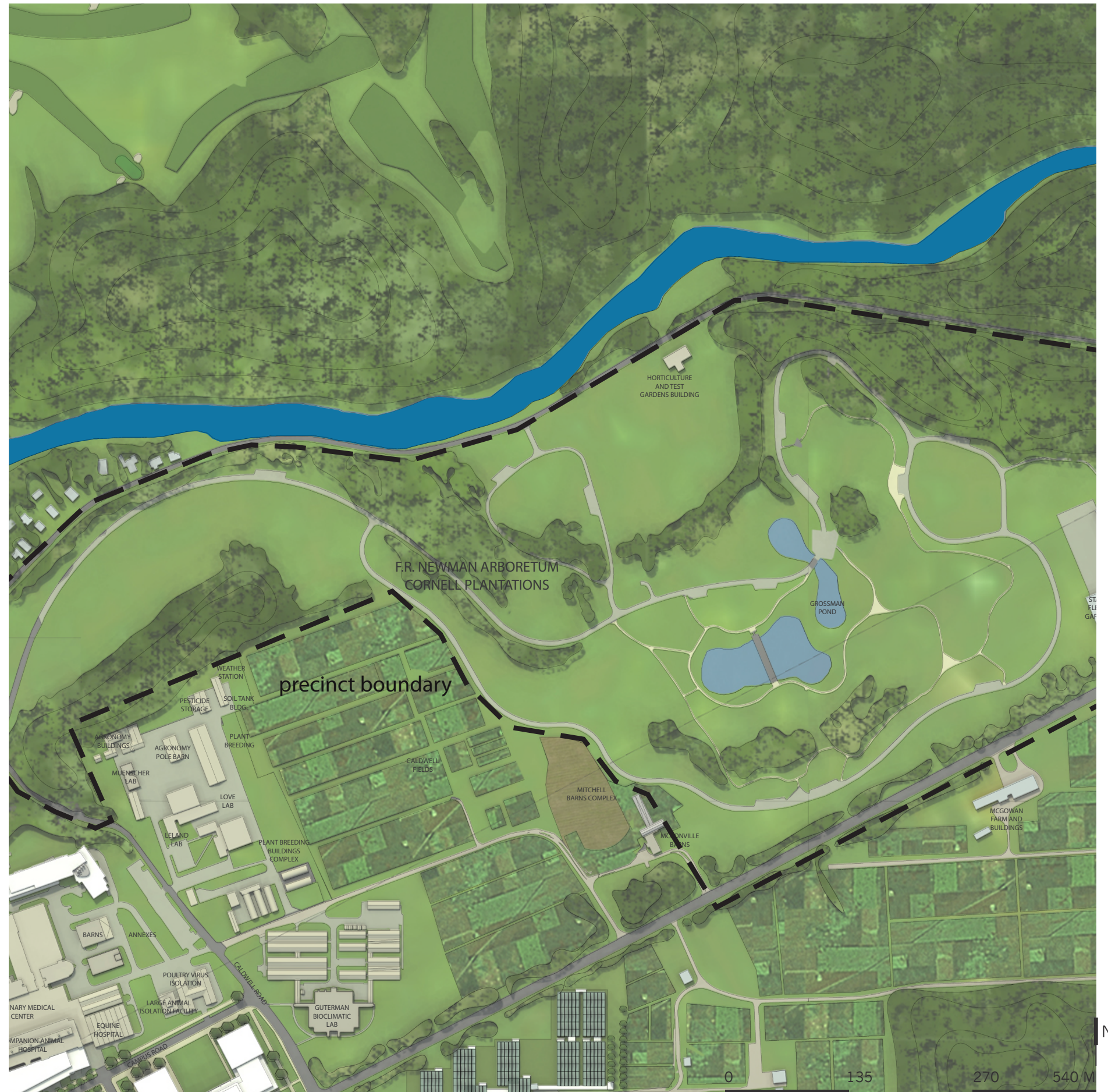
Zone Overview for Arboretum