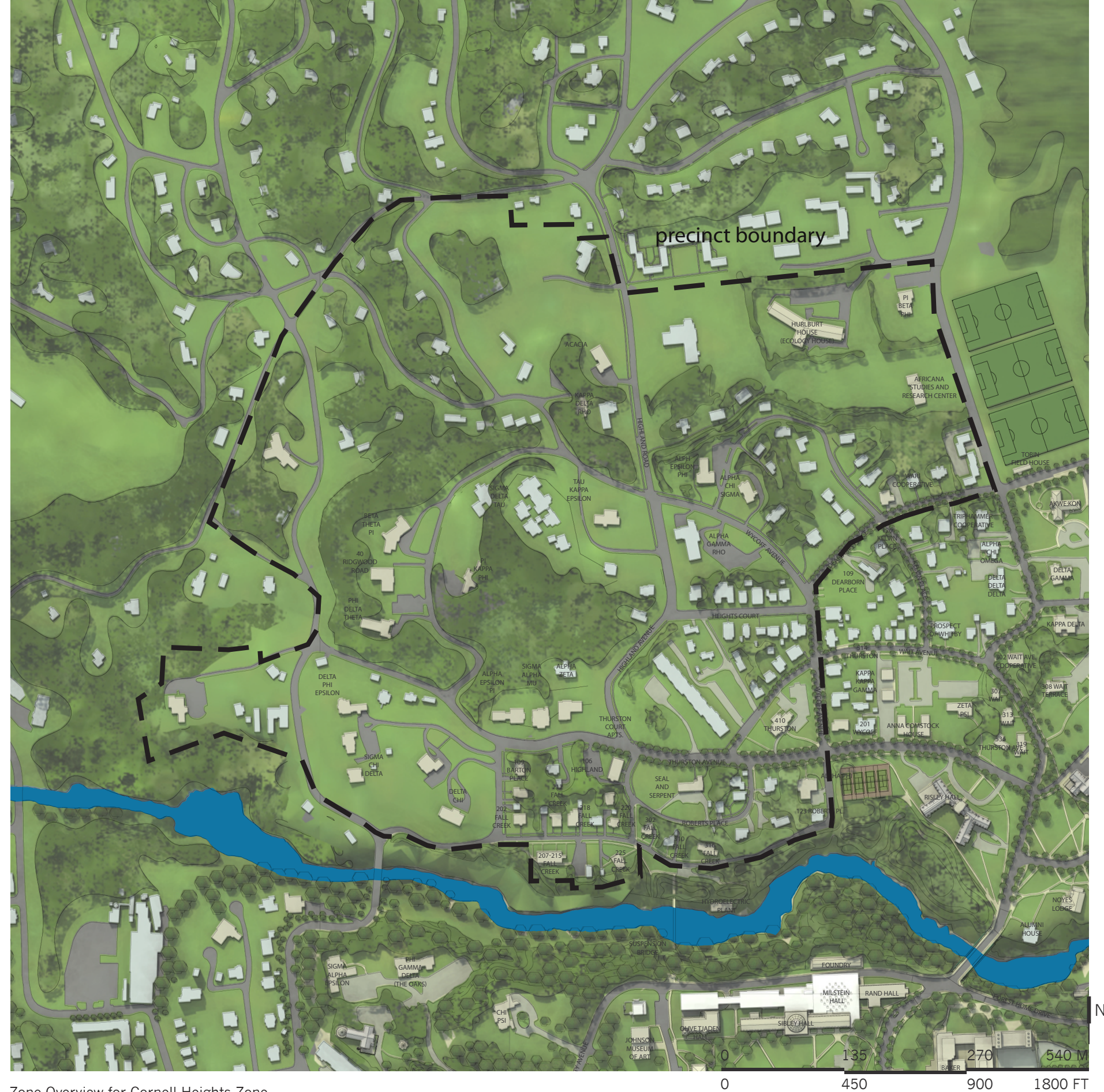
Zone Overview for Cornell Heights Zone