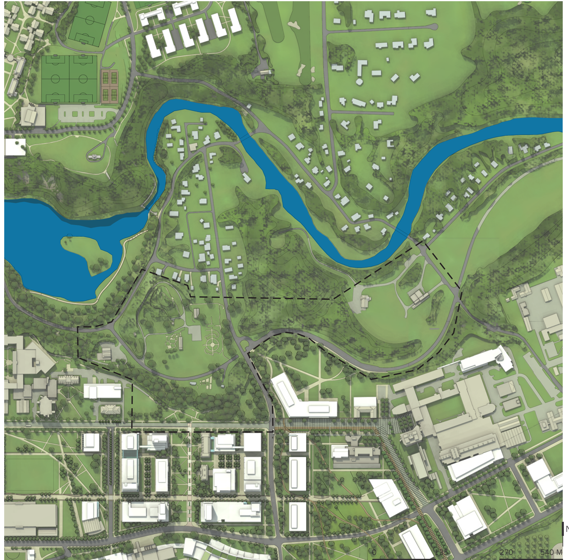
Zone Overview for Gardens