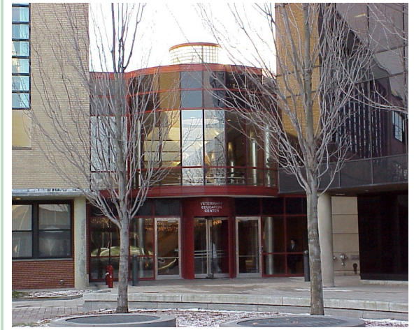
Vet Education Center Total Energy Use - Pre & Post ECI